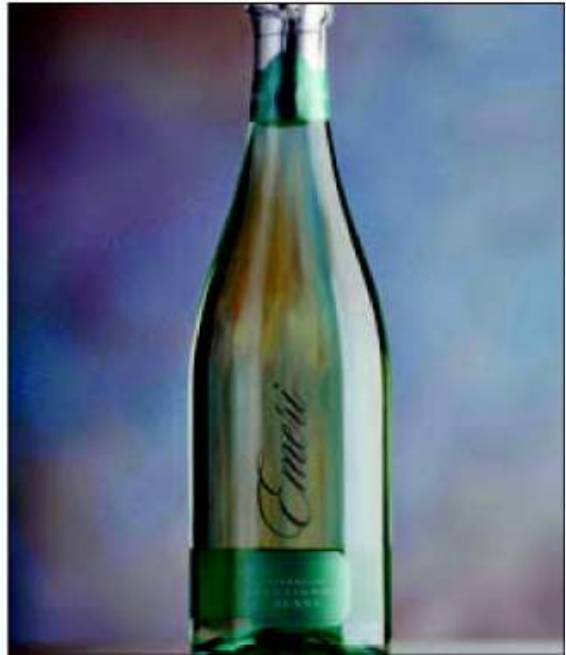
De Bortoli Emeri Sparkling Sauvignon Blanc, NV, $14. Good concept, but maybe theres good reason Sav Blanc rarely if ever makes an appearance in Champagne. 7.5/10.