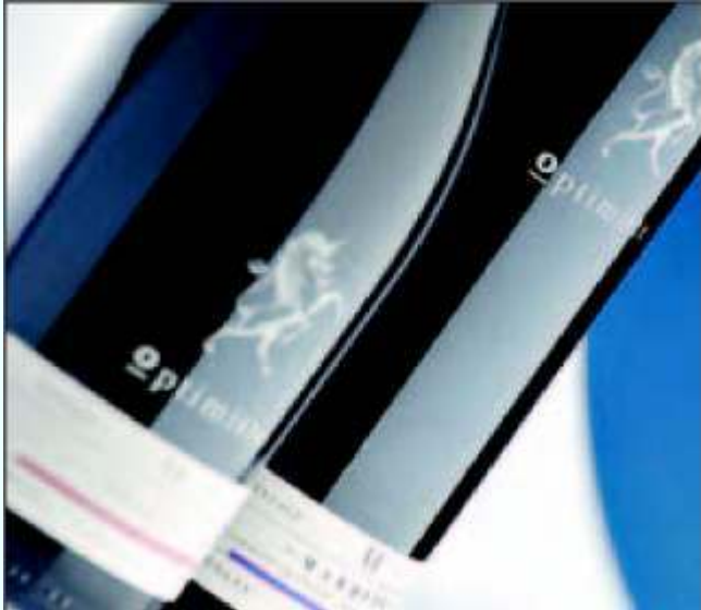
Optimiste Marquis Cabernet Sauvignon, Merlot, Petit Verdot, 2006, $24. An optimist would say that this is the best of all possible wines, a pessimist believes that is true. 8.4/10.