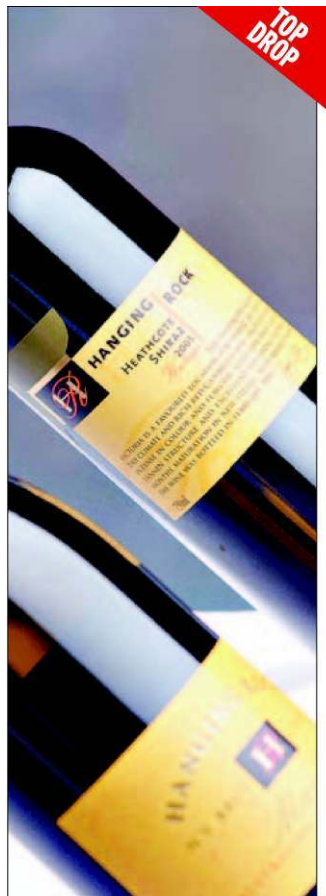
Hanging Rock Heathcote Shiraz 2005, $50ish. This is big-boy, big-red stuff with a big price to prove it. Can't wait to try the bigger boy, bigger red, $100 version. 9/10.