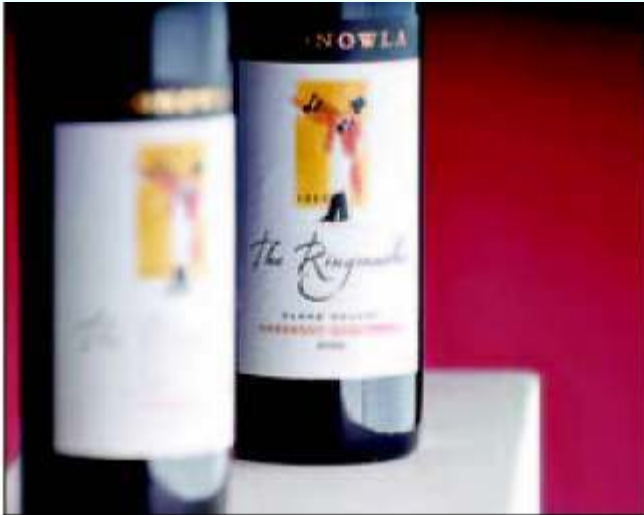
Koonowla Clare Valley The Ringmaster Cabernet Sauvignon 2006, $16. Don't you love getting more than you bargained for? Which reminds me, I never did understand Mum saying I would get just that if I didn't behave...wouldn't anyone want more? Great gear for the dough. 8.7/10.